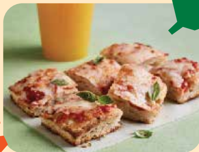
MARGHERITA PIZZA (G,D) 29

Melted cheddar and mozzarella cheese in toasted milk bread