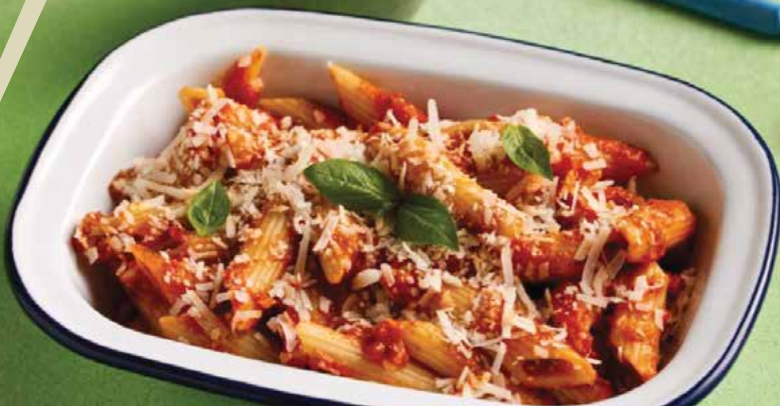
TOMATO PENNE (G,D,E,V) 28 Penne pasta tossed in a slow cooked tomato sauce