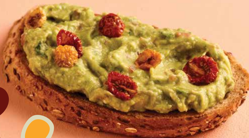
MINI AVOCADO TOAST (G,V) 24 Smashed avocado on toasted sourdough