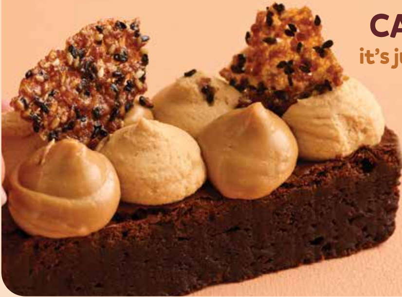
DARK CHOCOLATE & TAHINI BROWNIE (G,D,E) 33 Rich dark chocolate brownie

CAKE IT EASY, it's just a piece of cake.