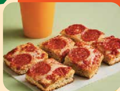
PEPPERONI PIZZA (G,D) 30

Topped with tomato sauce, mozzarella and basil